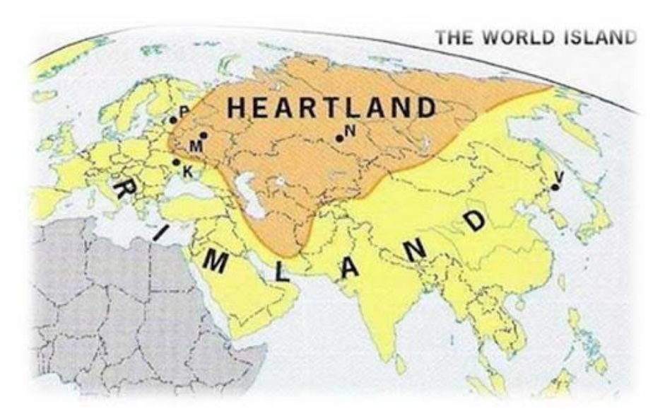
Figure 2: Spykman's Rimland