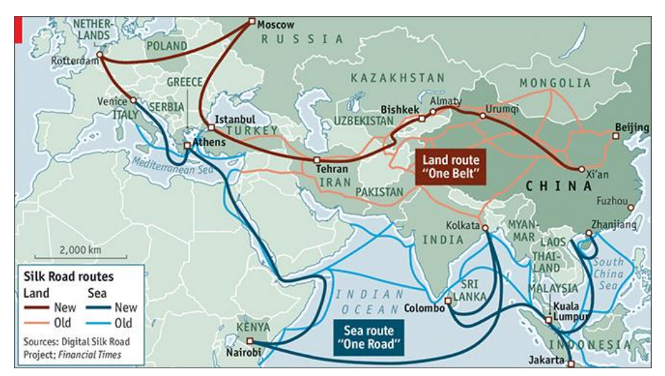
Figure 4: New & Old Silk Road Routes

Interestingly, China with its 'Belt and Road Initiative' (BRI) seeks to return to Eurasia by appealing to the historical 'Silk Road' to justify its presence (Frankopan, 2015, p. 184). The ancient Silk Road was designed for trade purpose to bridge China with Europe via Central Asia and the Middle East augmented by maritime routes. The BRI sponsors two main trade routes; the overland Silk Road Economic Belt across mainland Asia to Europe and to Africa, and the maritime Silk Road which is a shipping route through the Indian Ocean and the Suez Canal up to the Mediterranean Sea (Chatzky & McBride, 2020). This strongly reinforces the fact that China, with the help of BRI, wants to revive its ancient Silk Road which interestingly has both the components of land and sea routes. Interestingly, it is believed that by 2049, China with the help of BRI will be in position of having control over Afro-Eurasia (Pillsbury, 2015, p. 179). These coupled with the rejuvenation of the ancient ideologies such as Tianxia system and Confucianism China is trying to expand its influence through most of the world (Mirza, Abbas, & Nizamani, 2020; Mirza & Khan, 2020)